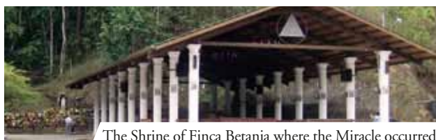
The Shrine of Finca Betania where the Miracle occurred