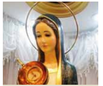
The new Tabernacle located in the chapel of Perpetual Adoration at the convent of the Augustinian Recollects of the Sacred Heart of Jesus in Los Teques, where the relics of the Eucharistic Miracle of Betania have been transferred.