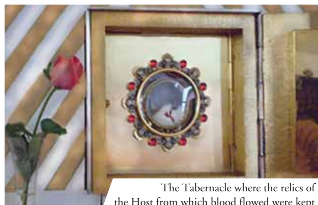
The Tabernacle where the relics of the Host from which blood flowed were kept