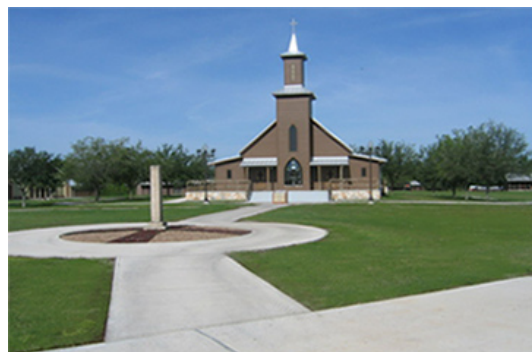
Spiritual Renewal Center Chapel

♥ Personal Needs: Each person is challenged to review the decision-making process and to examine the motives for seeking marriage.